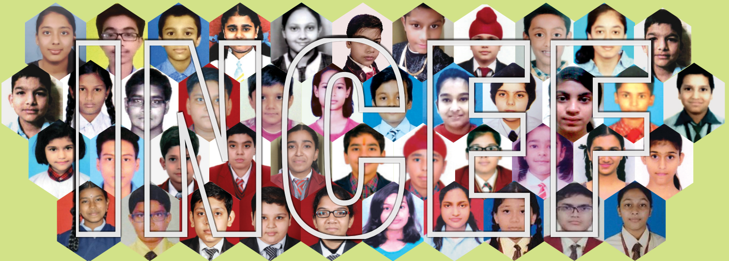
(Photographs of some of the students who qualified in the Written A.I.T.S.-2017 Examination.)

This year we are also going to award Laptops / Tablets to the deserving students. Entire Amount of the AWARDS / CASH AWARDS will be sent in March, 2018