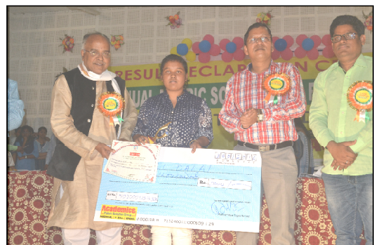
2016 AMSE e 2nd U®e ui rufu \kiAue Trust Ze`e euPKp_dar ij _eAZ Keu-icQuu